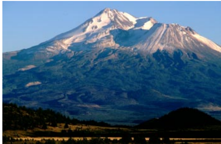
Mount Shasta, California.