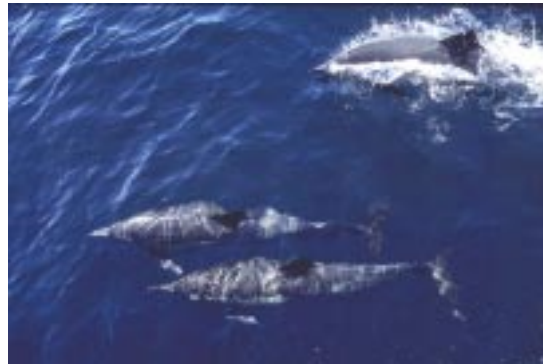
Common dolphins off the coast of Baja.