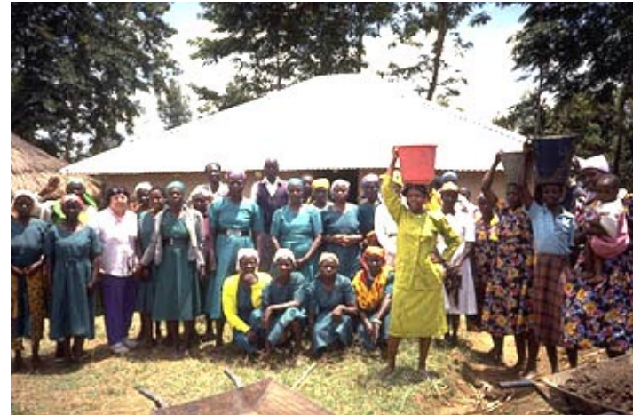
East African women's group seminar.

Richard and Rhoda Goldman Fund The Park Foundation