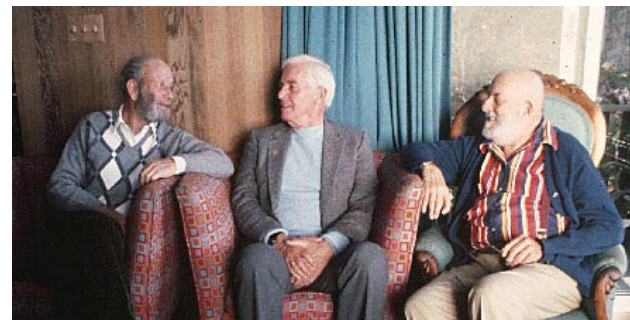
David Brower flanked by Edgar Wayburn (left) and Ansel Adams (right) in Carmel, California in November of 1983.