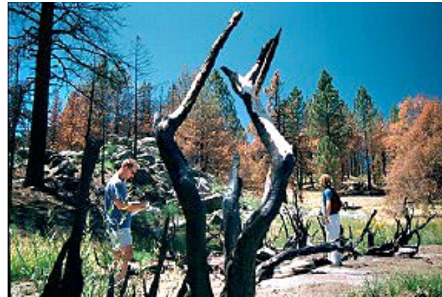
Staffmembers of the John Muir Project monitoring a salvage logging sale (timber sale to log in an area which was burned by wildfire) in Sequoia National Forest.