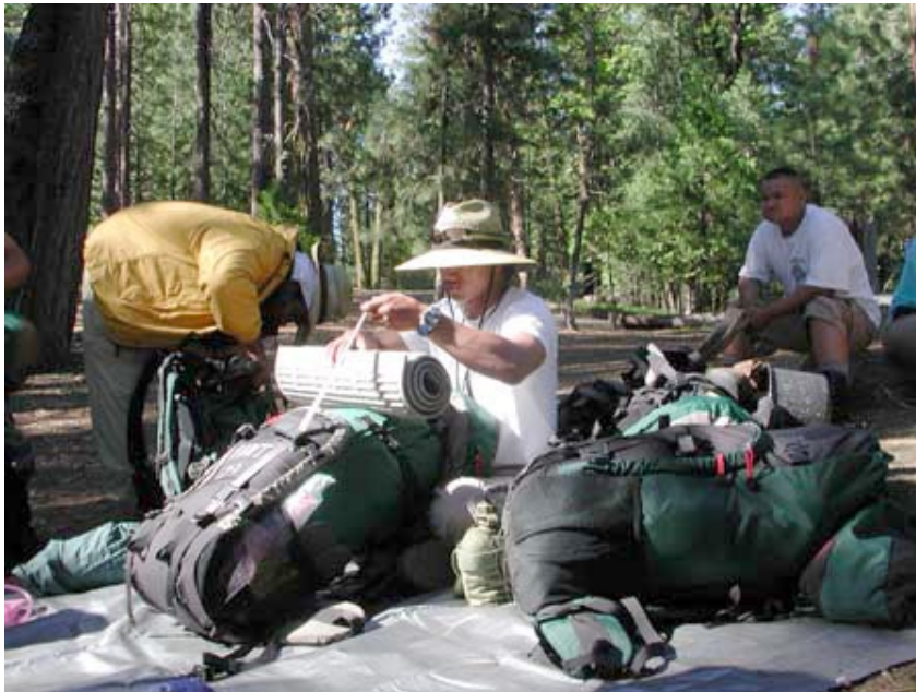
Participants in one of Bay Area Wilderness Training's Wilderness Leadership Training Courses.