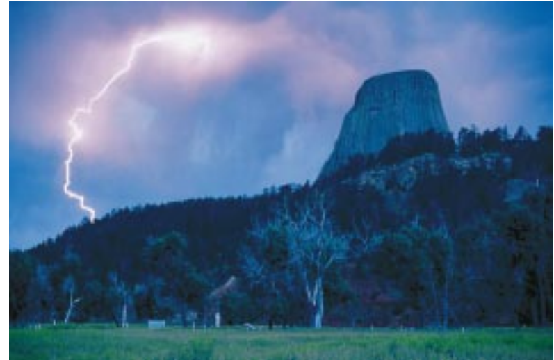
Devils Tower National Monument in Crook County, Wyoming, sacred site to Plains Indians.