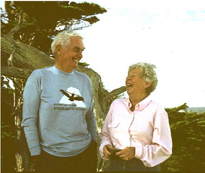
Dave and Anne Brower at Point Lobos, California, 1983.

But the moments I will savor and the times I will miss most are not with the Archdruid, but with my friend Dave, the kind, funny, generous old man I came to know and love working side by side with him in his final two and a half years. We had a joke that he was my adopted grandfather, but he was much more to me. In our time together, Dave became not only my oldest friend (he would appreciate the joke), but also my best friend.