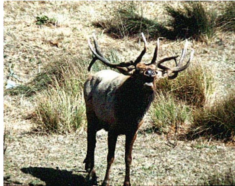
Tule Elk in Point Reyes, California.