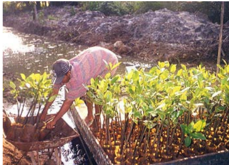
Member of the Youth Society loading mangrove tree seedlings onto a boat for transport to Chilaw Lagoon, Sri Lanka.