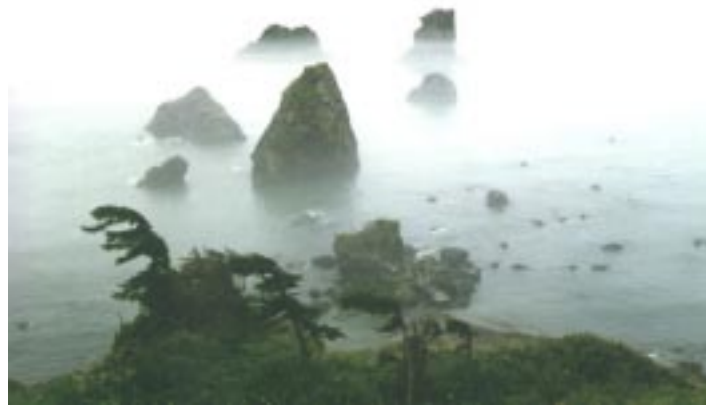
View offshore from Sakhalin Island.