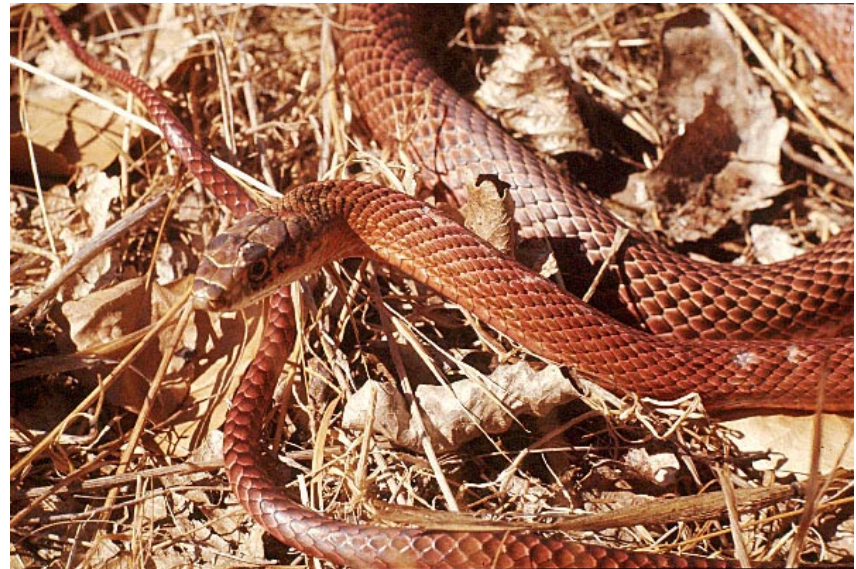
Red Racer snake in San Joaquin Valley.

The Bullitt Foundation Compton Foundation Foundation for Deep Ecology The Summerlee Foundation The Tides Foundation