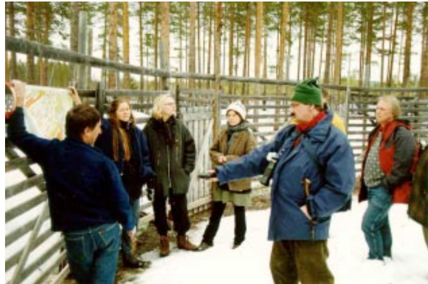
Strategizing with Saami reindeer herders and indigenous rights activists in Northern Sweden.

Boreal Forest Network Taiga Rescue Network Private donors & memberships